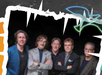
Donnie Iris and the Cruisers