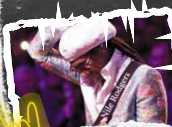
Nile Rodgers & Chic

We're throwing a special Year 10 party at the Nassau Amphitheatre, just steps from our ship! This exclusive event is just for 80s Cruise guests, so get ready to celebrate with an unforgettable concert under the stars!